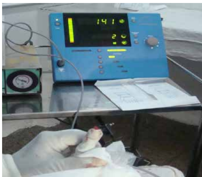
Figure 4: Gamma counter displaying radioactive counts from SLN (ex-vivo) placed on the Gamma probe

p = 0.04 ), greater median number of mitotic figures and greater incidence of ulceration. There were 3 false negative events. Three patients had temporary marginal mandibular weakness which resolved spontaneously. The median follow up time after SLNB was 6 months (range, 4 – 170 months). The 5-year survival rate after diagnosis of melanoma was 79%. So authors concluded that SLNB is safe and identifies nodal micrometastasis in approximately 20% cases. 3