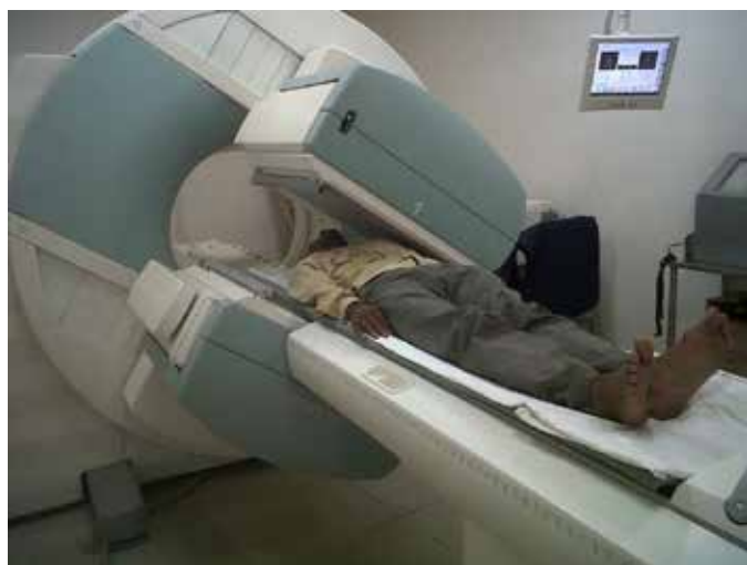
Figure 3: SPECT/CT