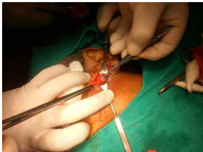
Figure 2: Blue stained SLN in preauricular region