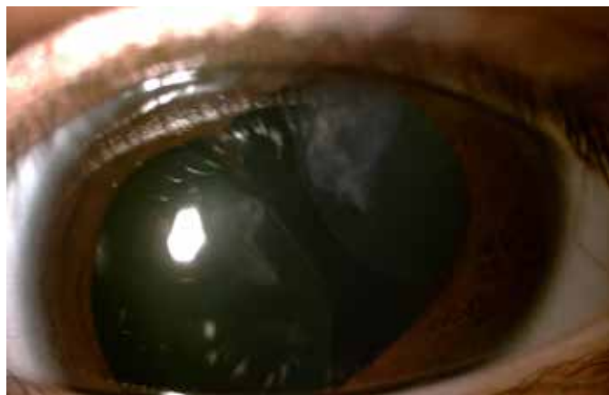
Figure 2: Showing twin crystalline lenses with oval, oblique pupil

case where there was the presence of two asymmetrical crystalline lenses in one eye, one being larger than the other and also had coloboma of iris and fundus. 2 Rupal Bhatt et al. reported a case with horizontally placed bi-lobular lens sharing a common capsular bag with inferior iris coloboma. 3 However, in our case the cornea was oval, the horizontal diameter is longer than the vertical diameter and two crystalline lenses were placed obliquely on the horizontal axis in the upper temporal and lower nasal quadrants. The mechanism for such formation of twin crystalline lenses in the same eye is not clearly understood yet. Duke-Elder has explained the possibility of lens plate invagination at two places during the embryonic stage which may result in two lens vesicles and thus the formation of twin crystalline lenses can take place. 5 Richardson suggested that central lens plate abnormality can also cause the formation of two lens vesicles which will lead to the formation of unilateral