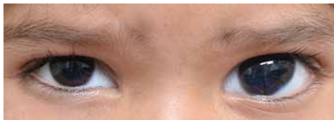
Figure 1: Showing the left globe is appearing larger than the right eye and also a horizontal axis of the left eye is obliquely placed

Congenital twin lenses is a very rare condition with only a few cases reported so far. 1,4 Thakkar et al reported a case of the congenital two lenses which were placed obliquely in a straight line with a clear space in between with the absence of zonules and capsule. 1 Richardson reported a similar