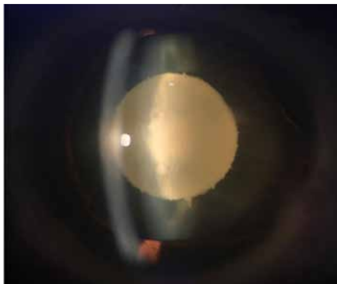
Figure 1: Right eye showing the central lamellar cataract with radial riders