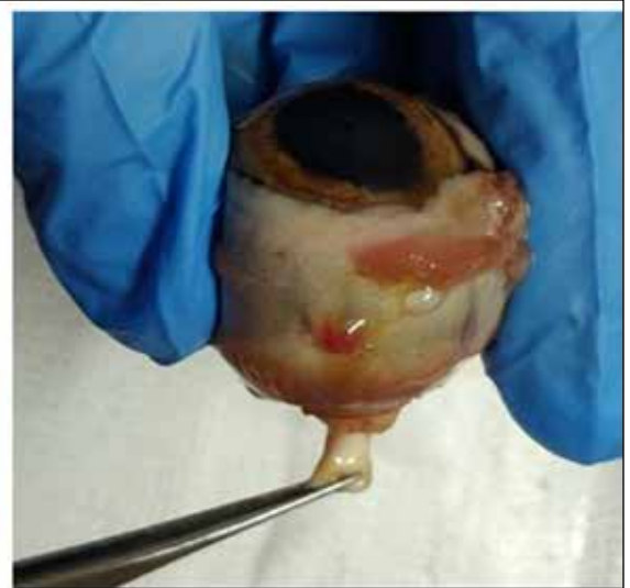
Gross anatomy and optic nerve