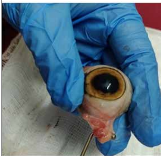
The enucleated goat's eye