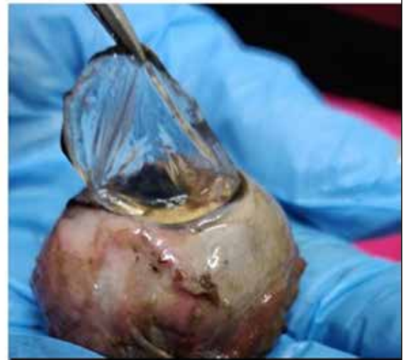
Excision of the Cornea