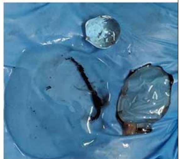
The transparent structures