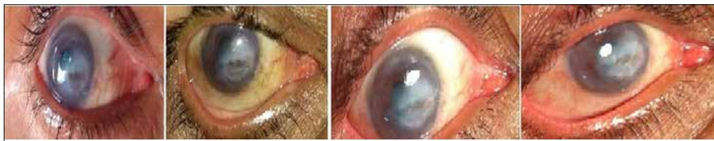
Figure 3: Shows series of images at day 1, day 7, after 1 month and after 3 months of a case of non healing corneal ulcer undergoing treatment along with BCL application.