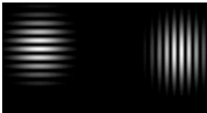
Figure 4:- Gabor patches.