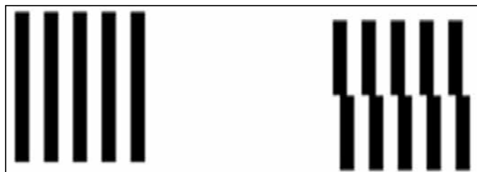
Figure 2: Vernier Acuity Testing.

The drawback of perceptual learning is that most of the studies which favoured perceptual learning work done in a very small sample and long-term follow-up for the efficacy of the therapy is lacking. Moreover, the efficacy of this therapy was established in laboratory settings only and not in real life situations (Figure 2,3, and 4). 41