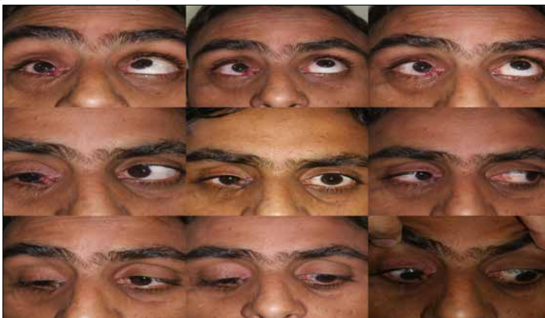
Figures 1: Nine gaze image of the patient showing limitation abduction and elevation of right eye.

On examination, his visual acuity was 6/6 in both eyes with normal intraocular pressures. On checking extraocular motility, there was marked restriction of ocular movements of the right eye in the attempted right lateral and up gaze (Figure 1).